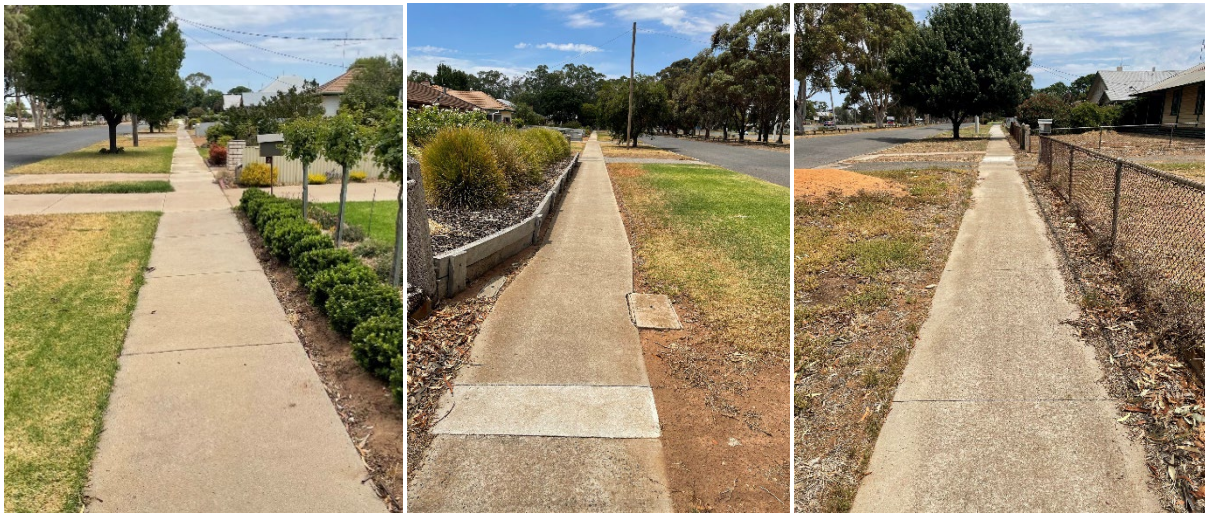
Images: Dimboola Road Footpath Warracknabeal.