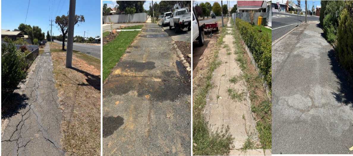
Images: Lascelles Street Hopetoun, Cromie Street Rupanyup, O'Brien Street Warracknabeal