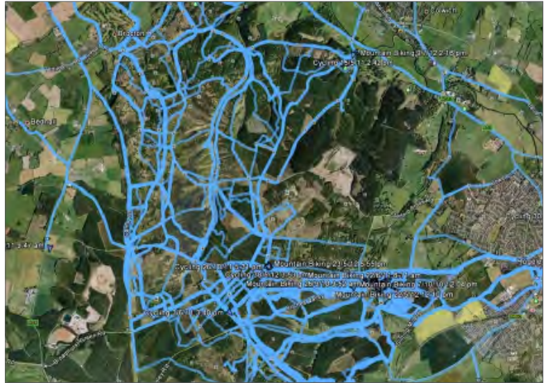
A typical 'Map My Ride' output from a mountain bike rider

Increasing use of smart phones and apps allows people to obtain information, communicate with each other very quickly, and provide feedback on their recreation experience at any time of the day or night. Many people using parks, playgrounds, paths and trails make the decision on where to recreate based on the information available via the internet, blogs, forums and social media.