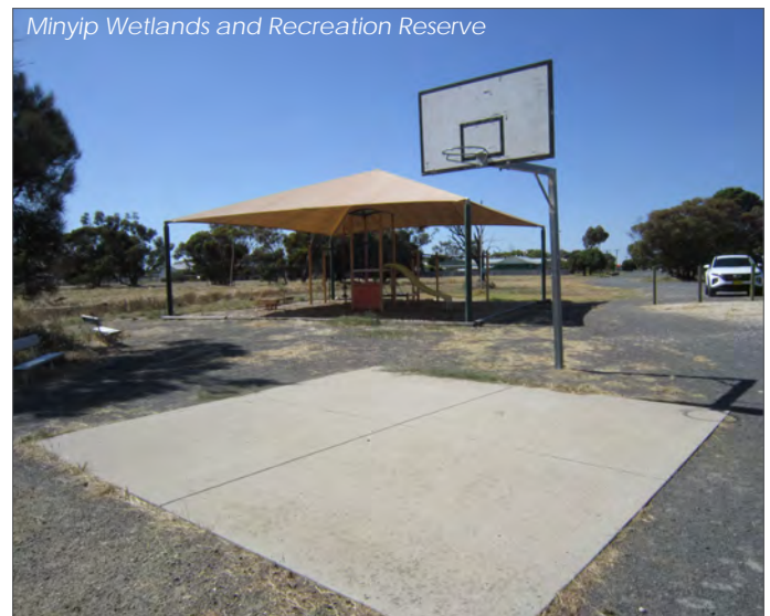
Minyip Wetlands and Recreation Reserve