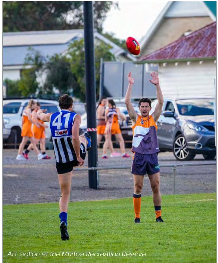
AFL action at the Murtoa Recreation Reserve

The replacement of turf fields with synthetic fields, however, can significantly increase carrying capacity by limiting maintenance-required field down time. A number of facility providers are moving toward the provision of synthetic fields (particularly for football and hockey where internationally certified surfaces are available). As an oval hosting AFL and cricket, synthetic is not considered an appropriate surface for Minyip Recreation Reserve. Indeed, the field surface was recently upgraded providing one of the more quality playing fields in the Region. Additionally, with both the AFL and cricket clubs being 'shared' between towns, the existing surface does not suffer from overuse.